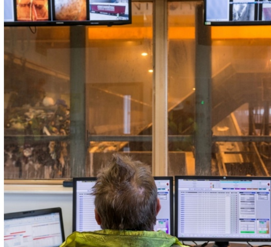
Territorio e Risorse Srl | Santhiá, Italy