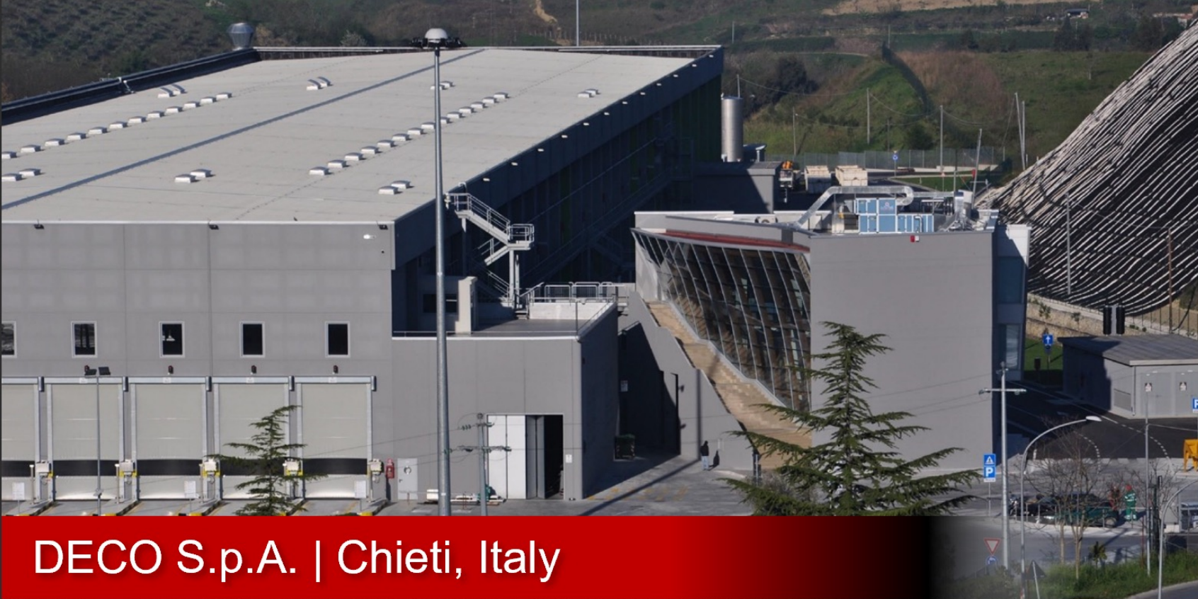
DECO S.p.A. | Chieti, Italy